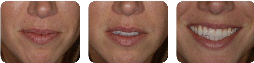
Lips together, repose, and full smile.