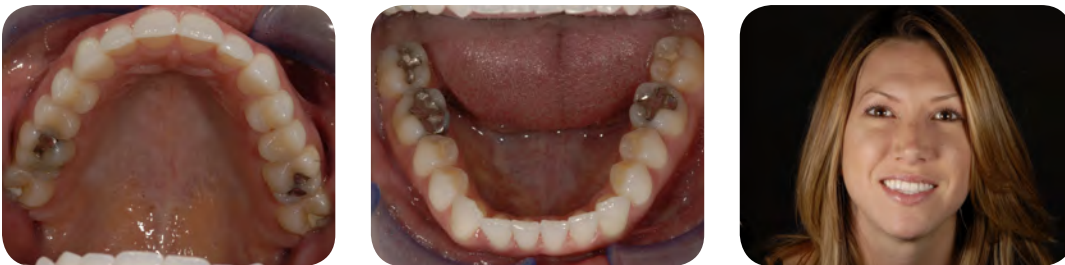
Occlusal views and full face portrait.