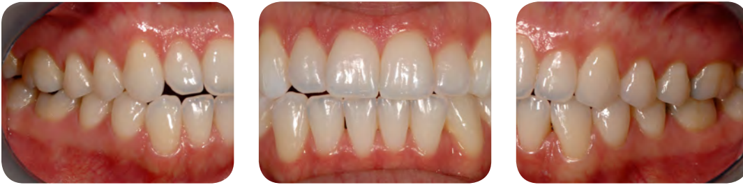
Right, center and left retracted views.